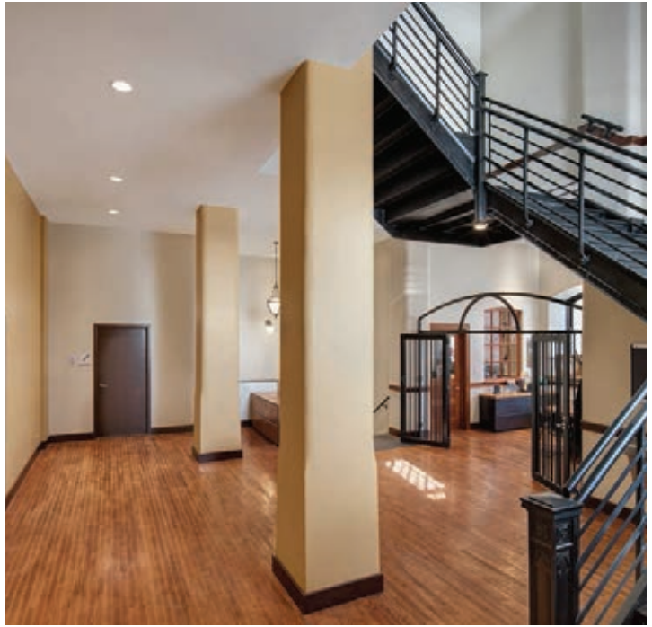
The former Sears Tower, before and after its renovation.

tion and recreation services that Chicago’s underserved neighborhoods typically lack, including a gymnasium, a fitness center, an indoor swimming pool, and recreation and meeting rooms. More than 6,000 visitors come to the center each week.